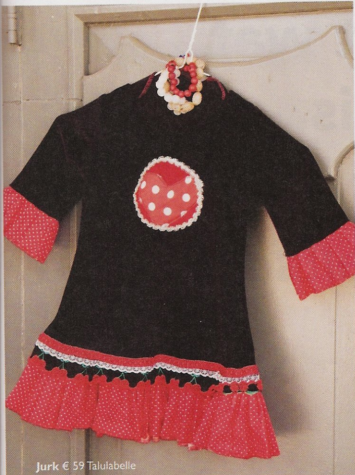
Jurk € 59 Talulabelle