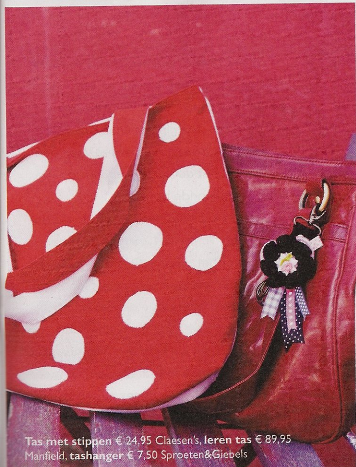
Tas met stippen € 24,95 Claesen's, Ieren tas € 89,95 Manfield, tashanger € 7,50 Sproeten&Giebels